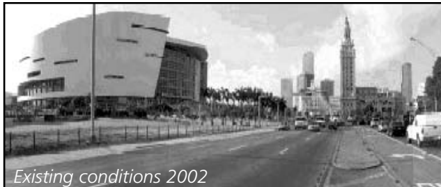
Existing conditions 2002