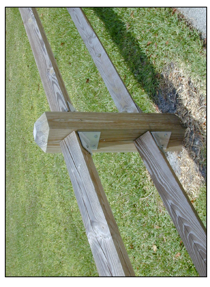
TYP. SPLIT RAIL FENCE NFB